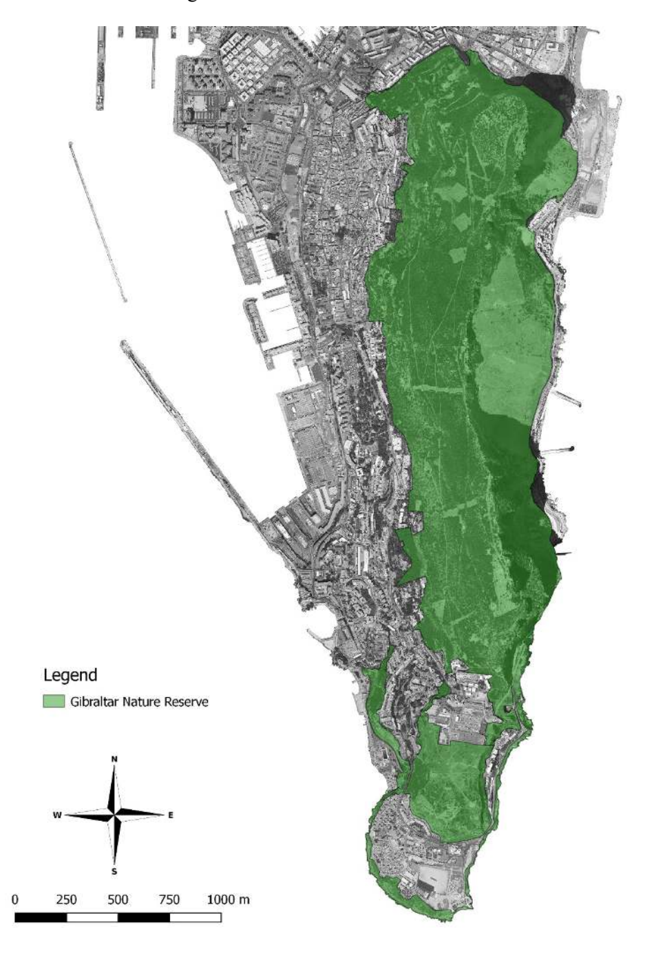
Figure 2. Gibraltar Nature Reserve.