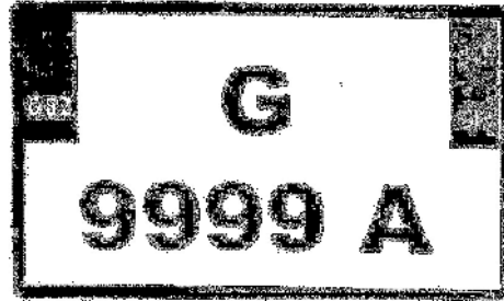
DIAGRAM 6 (REAR PLATE OF MOTORCYCLES ONLY)