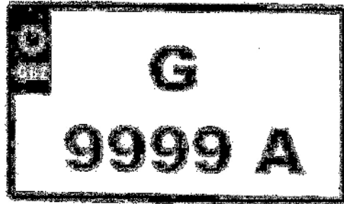
DIAGRAM 3 (REAR PLATE OF MOTORCYCLES ONLY)