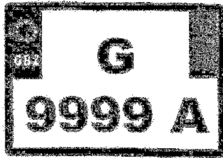
DIAGRAM 6 (REAR PLATE OF MOTORCYCLES ONLY)