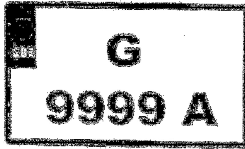
DIAGRAM 3 (REAR PLATE OF MOTORCYCLES ONLY)