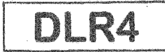
DIAGRAM 7 (Dealer Licence Plates)