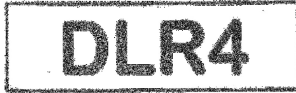
DIAGRAM 7 (Dealer Licence Plates)