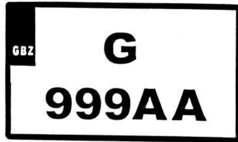
DIAGRAM 3 (REAR PLATE OF MOTORCYCLES ONLY)