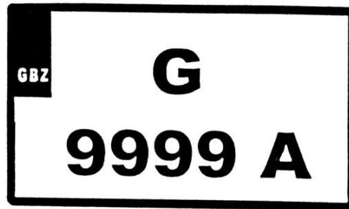
DIAGRAM 3 (REAR PLATE OF MOTORCYCLES ONLY)