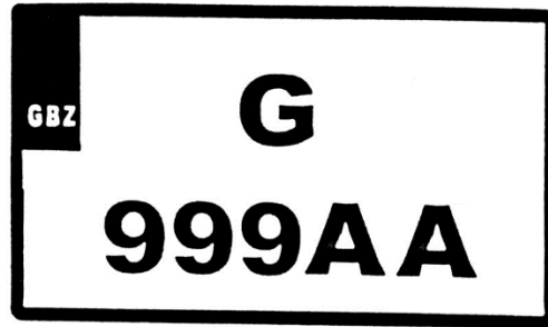
DIAGRAM 3 (REAR PLATE OF MOTORCYCLES ONLY)