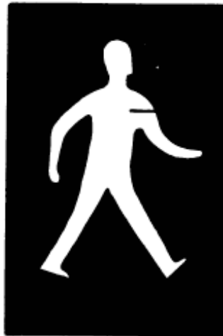
Green Figure upon a Black Background