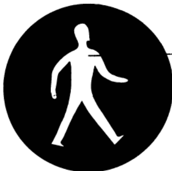
Green Figure upon a Black Background