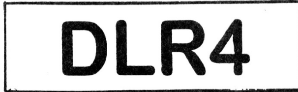
DIAGRAM 7 (Dealer Licence Plates)