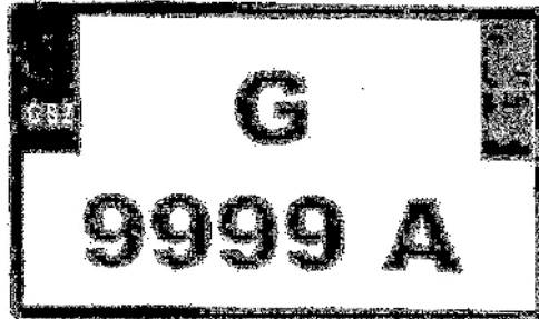
DIAGRAM 6 (REAR PLATE OF MOTORCYCLES ONLY)